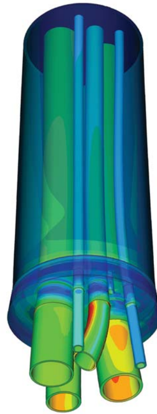
Typical FE Analysis.